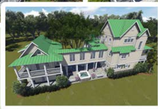
Unit #11 Combination

Maintain the value of your property and achieve maximum sales prices on land and lots impacted by set backs, easements, narrow frontage and other challenges.