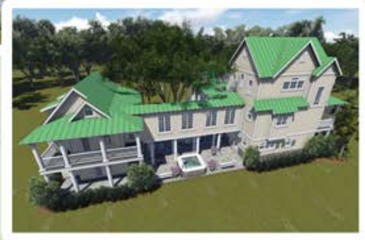
Unit #11 Combination

Maintain the value of your property and achieve maximum sales prices on land and lots impacted by set backs, easements, narrow frontage and other challenges.